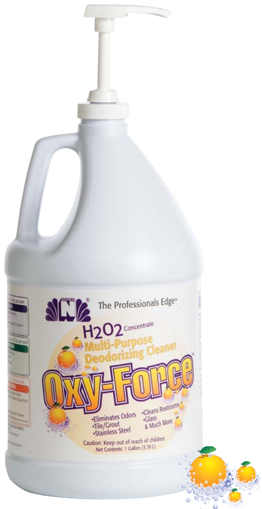
Oxy-Kit is packed: 4 gallons per case, plus 3 empty RTU quart bottles, quart sprayers, 1 proportioning pump.

Oxy-Force™ is available in 4/1 case of gallons with our PUMP&GO dispenser; which portions out 1/4 oz. of H2O2 Oxy-Force™ with every pump, for easy maintenance. Included with the pump dispenser are 3 quart bottles, each screen printed with the different applications.